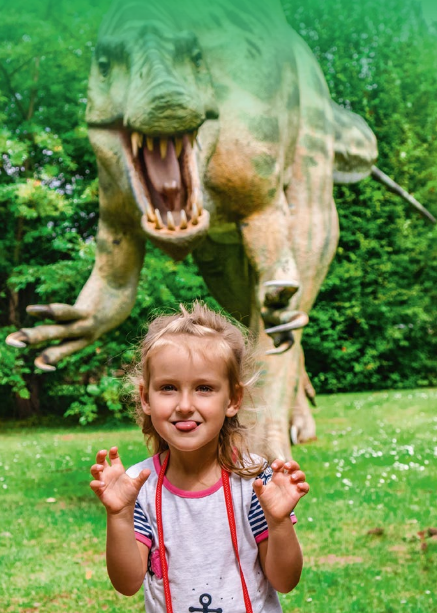
📷 Dinosaur Park in Jurowce, photo E. Ziętyk

The time you spend together with your children is the most precious gift you can offer them. How can you best use it for their benefit and development? We suggest a family leisure time with history in the background. Take them to a dinosaur park, or let them feel like a farmer in an old village, or take them on a walk around an open-air museum.