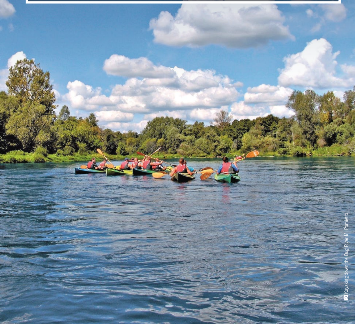
Kayaking down the Bug River

A wealth of nature in the Podlaskie rivers is best seen from a close perspective, e.g. when kayaking. You can also set off on a rafting trip down the Biebrza River. On the Narew River you will be surprised to see traditional boats known as psychówki . The Biebrza River is surrounded by vast swamp and peat bog areas, nesting birds and the king of this land – the elk. The meandering Narew with its widely branched river bed and surrounding marshlands, is known as "the Polish Amazon". The Bug River will take the visitor to the picturesque and culturally attractive southern part of the region.