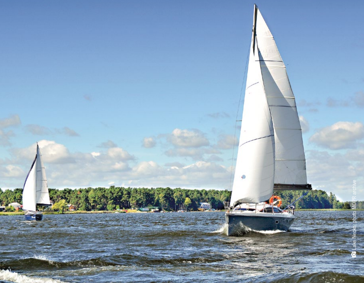
© Lake Necko, photo MO R archive

Podlaskie's numerous lakes not only adorn the landscape. They also offer plenty of opportunities for active water leisure. In addition to ship or catamaran cruises, tourists can benefit from a unique offer to hire a round sailing boat, or even to take part in the World Round Boat regatta on Lake Pomorze. Local tourist facilities around the lakes include modern water equipment hire and leisure centres which offers accommodation even in the most unexpected places, such as round cottages in Poland's only "Clay Village". Various boats such as wooden gondolas and the Jaćwież passenger ships in the style of a Yotvingian boat are tourist attractions of the Augustów Canal.