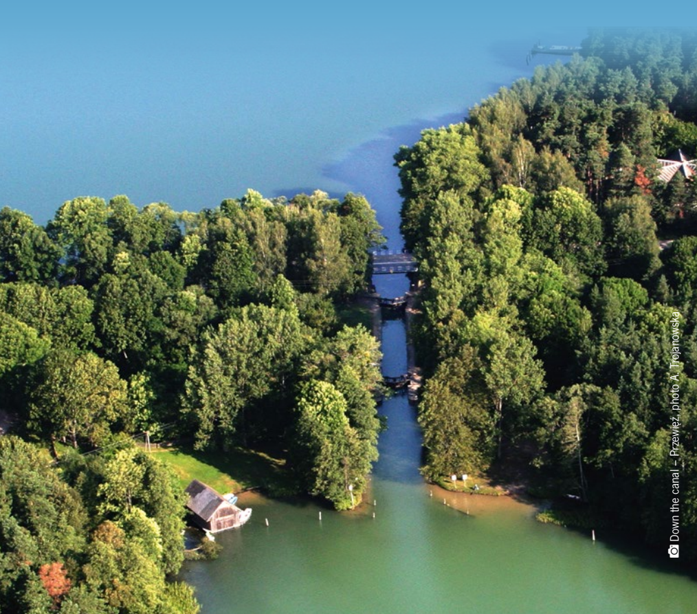
Down the canal – Przewięź

border (Kurzynie). The canal is a 19th-century historic landmark. You can learn the history of its construction at the Museum of History of Augustów Canal , one of the branches of the Museum of the Augustów Region.