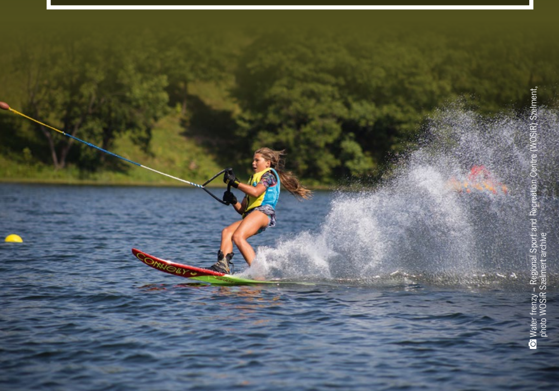
Water frenzy – Regional Sport and Recreation Centre (WOSiR) Szelment

Municipal Culture, Sports and Recreation Centre ul. 1 Maja 19, 17-250 Kleszczele Phone: +48 85 6818054 E-mail: moksirkleszczele@gmail.com